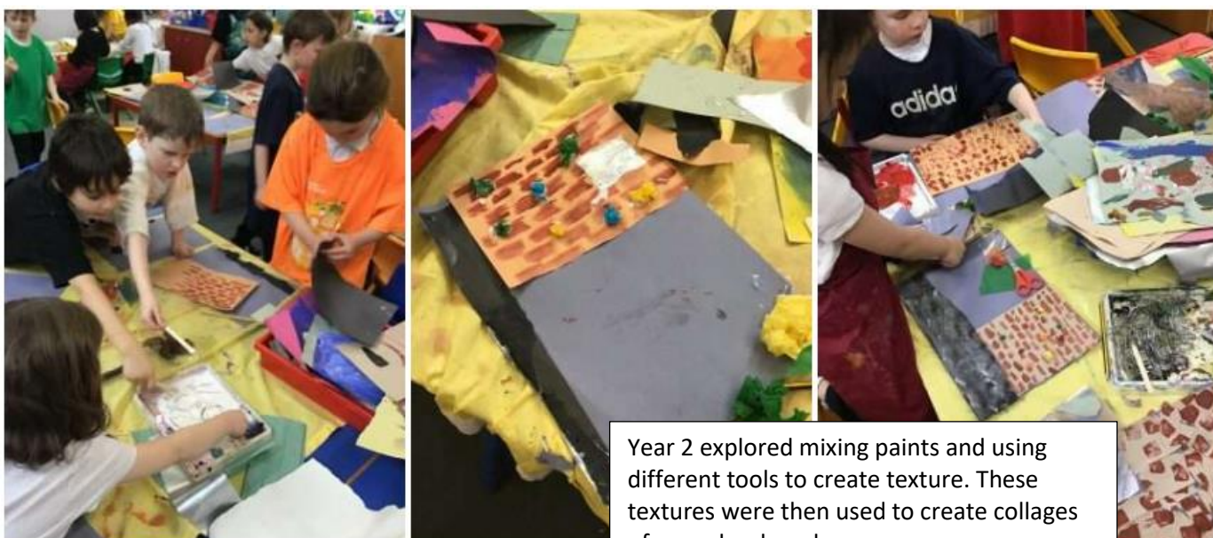
Year 2 explored mixing paints and using different tools to create texture. These textures were then used to create collages of our school yard.