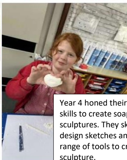
Year 4 honed their sculpting skills to create soap sculptures. They sketched design sketches and used a range of tools to create their sculpture.